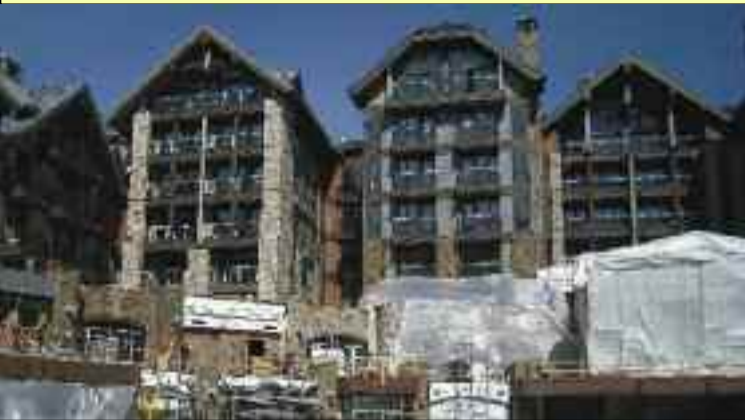
This picture was taken in April 2010.