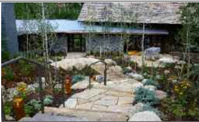
Stevens can help you make your home more beautiful.

SHC has built its reputation by offering a wide range of landscape services with professionalism and pride. Their staff averages five